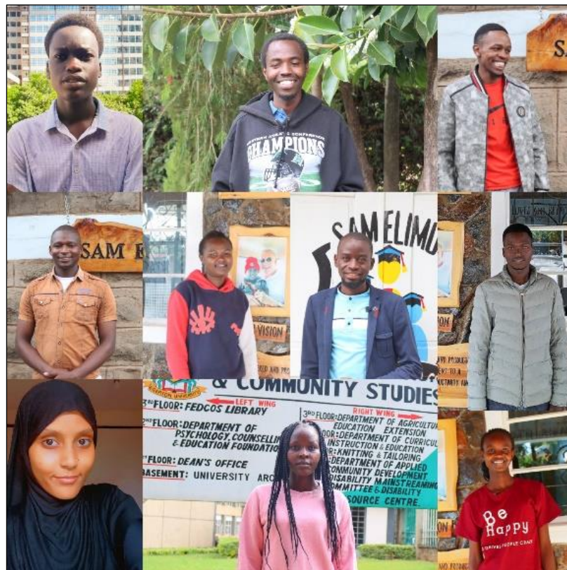
Congratulations to the new SAM Elimu scholarship recipients.