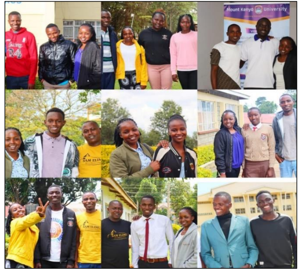
The SAM Elimu team site visits with the tertiary students.

The SAM Elimu team visited our tertiary students studying in the western circuit to monitor their academic performance, assimilation into school, implementation of the enrichment topics, and general progress. Over the course of six days, we visited Laikipia University, Kenya Medical Training College (Nyahururu and Kisii campuses), Egerton University, Ol' Lessos Technical Training Institute, Moi University, Kabarak University, Londiani Girls, Maseno University, Mt. Kenya University (Kisumu campus), and Tom Mboya University. We are pleased to report that all the students are happy and thriving.